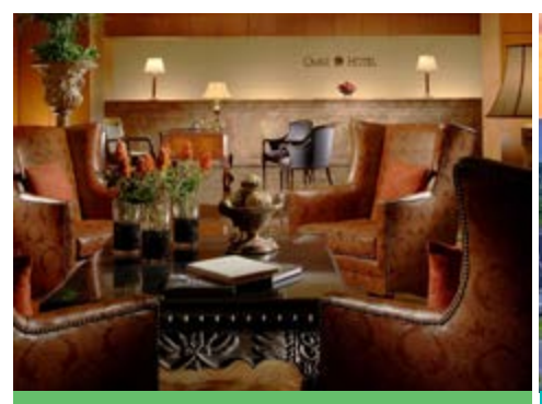
AMC Summit July 16 Omni Richmond Hotel